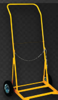
G Size - Pneumatic